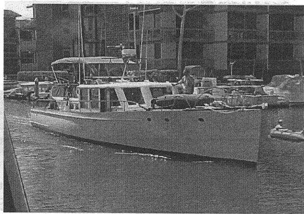
Old Age cruising the Marina Pacifica channel - 2002

For over 15 years the Southern Fleet has enjoyed a day or two at a place on the water called Marina Pacifica. Many years ago, this event took place on Mother's Day weekend at the same docks as it is today. There were small shops and food stores located in the ground floor, including a Trader Joes that was so small one could not use a shopping cart. That was before 2 buck chuck. Friday evening was a cocktail party on the dock. Saturday, the men sat around, tinkered with their boats and gave advice to anyone who would listen. The girls spent the day at Buffums (now Loehmans) shopping for stuff and talking about the men. Sunday, in honor of Mother's Day, each lady was given a corsage to wear and was treated to brunch at a local restaurant or yacht club. The event concluded with a parade, with boats also in full dress, back to everyone's respective home ports.