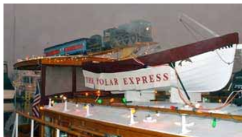
Polar Express aboard Bounty

For the most part, the weather was very cooperative for the Lighted Boat Parade on the San Rafael canal on December 10th. That morning I repositioned North Star II from her berth in the San Rafael Harbor to the Marin Yacht Club, our staging area, once again, for the CYA yachts and finished up the lighting and deco-