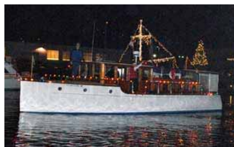
Cielito beautifully decorated for the parade

Jim Sweeney after he had tied up Bounty looked a little pale too. Bounty it seems decided to shut down her starboard engine for part of the parade too (in sympathy with