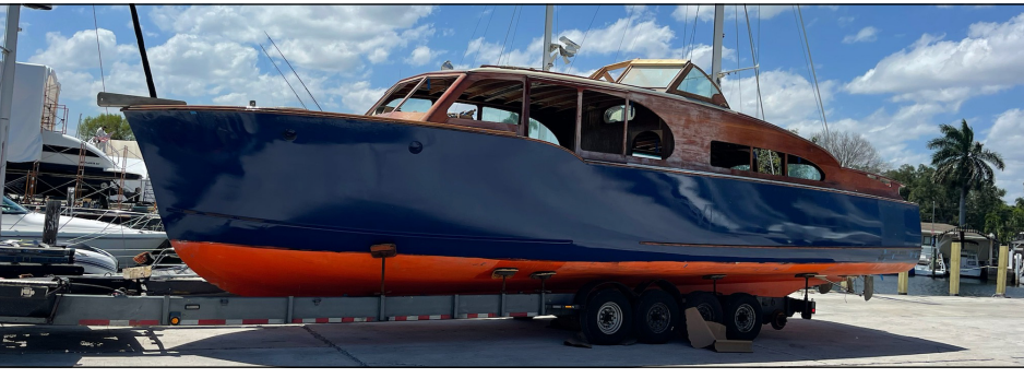
▲ April Ann in April, 2023

Time went by and she eventually sold in early October, 2020. The new owner had it trucked to Miami Beach FL. where she was put on the hard and a tent built around it. He hired a crew of 5 and working 5 days a week under the supervision of a lead shipwrite (one of the 5), they gutted the boat to the frames. Then sistered every frame and replanked the entire bottom below the water line with Spanish cedar. Windows were removed and fly bridge taken off for various repairs including some dry rot. The fwd. bulkhead