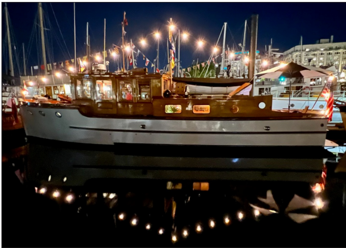
▲ Thelonus all dressed up for a night in Victoria