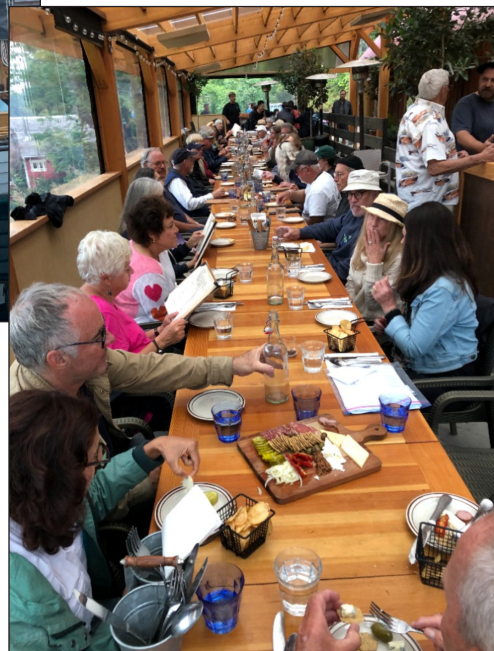
▲ Lunch at the Salt Spring Wild Cider House