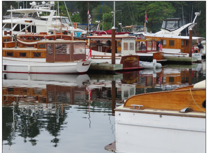
Classics gathered in Ganges on Salt Spring Island ▼