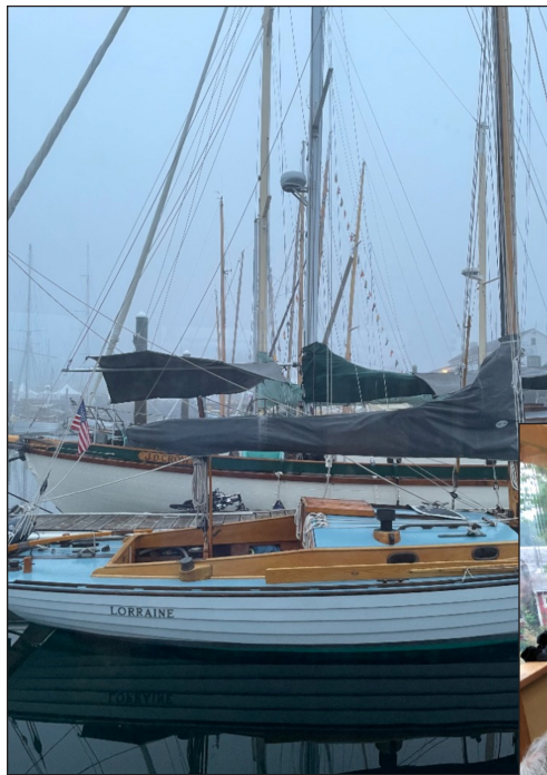
◀ A foggy morning in Port Townsend

We are so privileged to be boaters in this part of the world, and to have such events available to us. I urge all CYA members to take advantage of these amazing experiences. ■