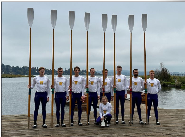
▲ Recreating the 1936 “Boys in the Boat” Rowing Team Photo

plan was that the large rowing shell (it is 60’ long!) would be trailered down from Port Townsend early the morning of October 8th and launched at the new UW Shellhouse, the Conibear Shellhouse. The old UW Shellhouse will start the restoration process shortly following the nearly complete capital campaign, but that is a story for another day. In any event, the Conibear Shellhouse had the perfect place to launch the Husky Challenger, and the UW Rowing Coach, and the organizers of the “Return of the Husky Challenger” event decided that it would be fantastic to re-create some of the images of the 1936 Boys in the Boat Rowing Team by having UW rowers in costumes similar to what they wore in 1936 row the shell. Great idea for sure. The plan was for the UW rowers to row the shell from UW to MOHAI. Fabulous plan. And then Mike and Dianne asked me “can you get some old boats to come with us and make a parade?” Are you