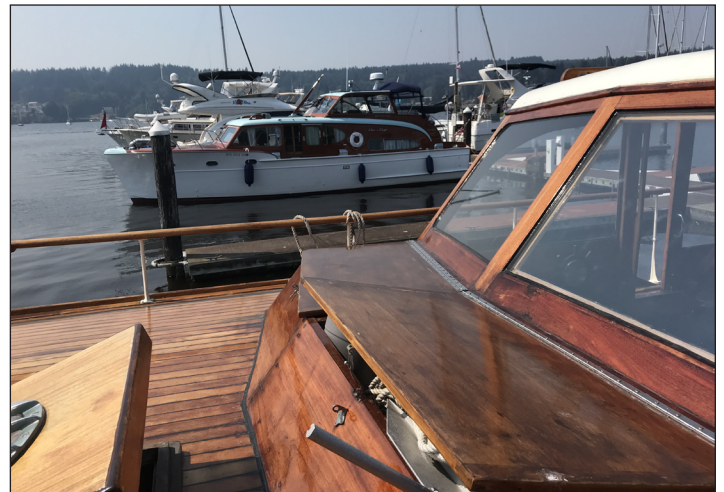
▲ Saga and Reverie at the Liberty Bay Festival

presentation Saturday afternoon on the restoration of the Tiburon (USCG-11, CG 83366), the last of the several wooden hulled 83 foot cutters that served as rescue vessels off Omaha Beach during the 1944 D-Day landings in Normandy, France. Do retired warships qualify for inclusion in CYA? ■