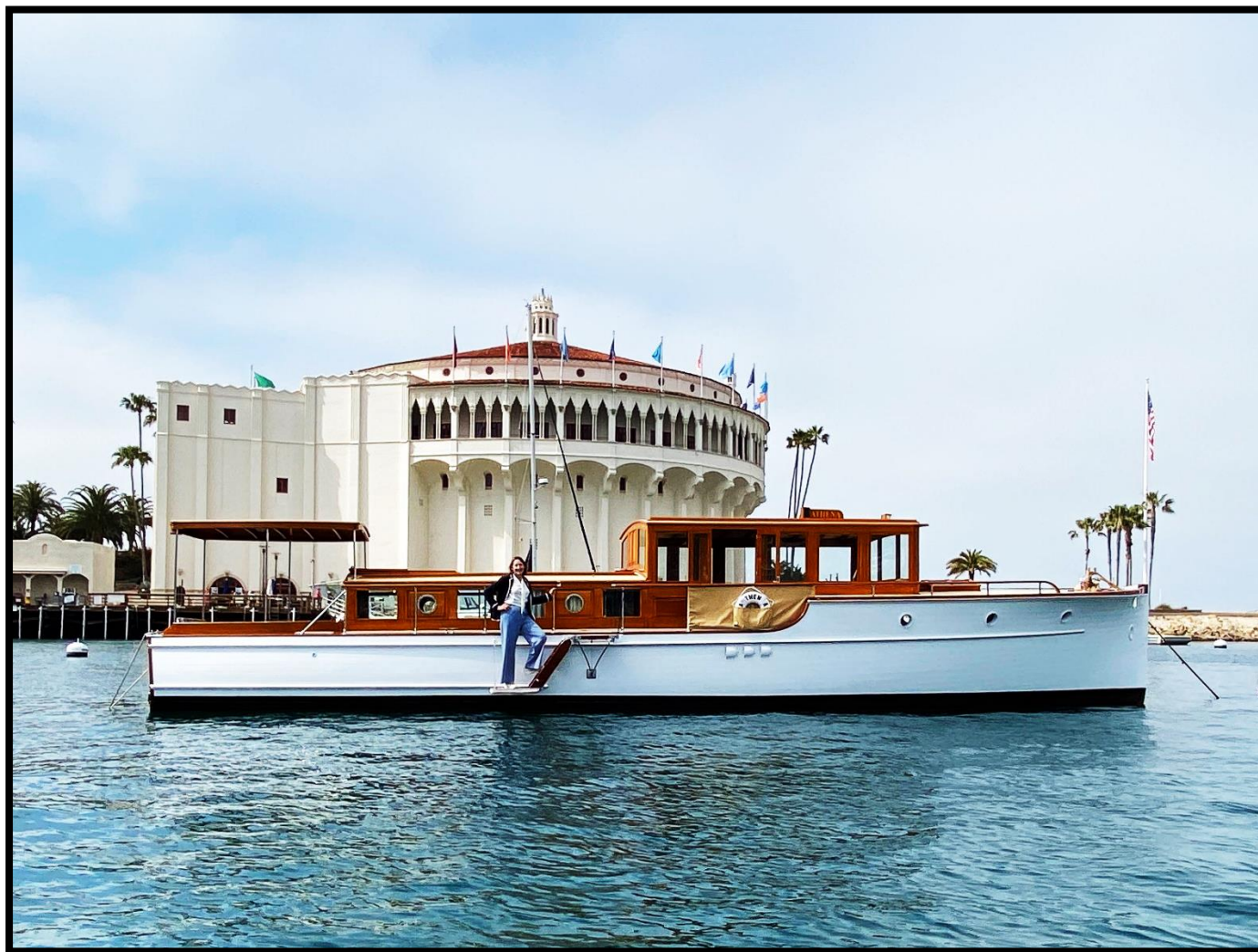
"ATHENA @ The Avalon Ballroom"

SOUTHERN CALIFORNIA FLEET ♦ CLASSIC YACHT ASSOCIATION