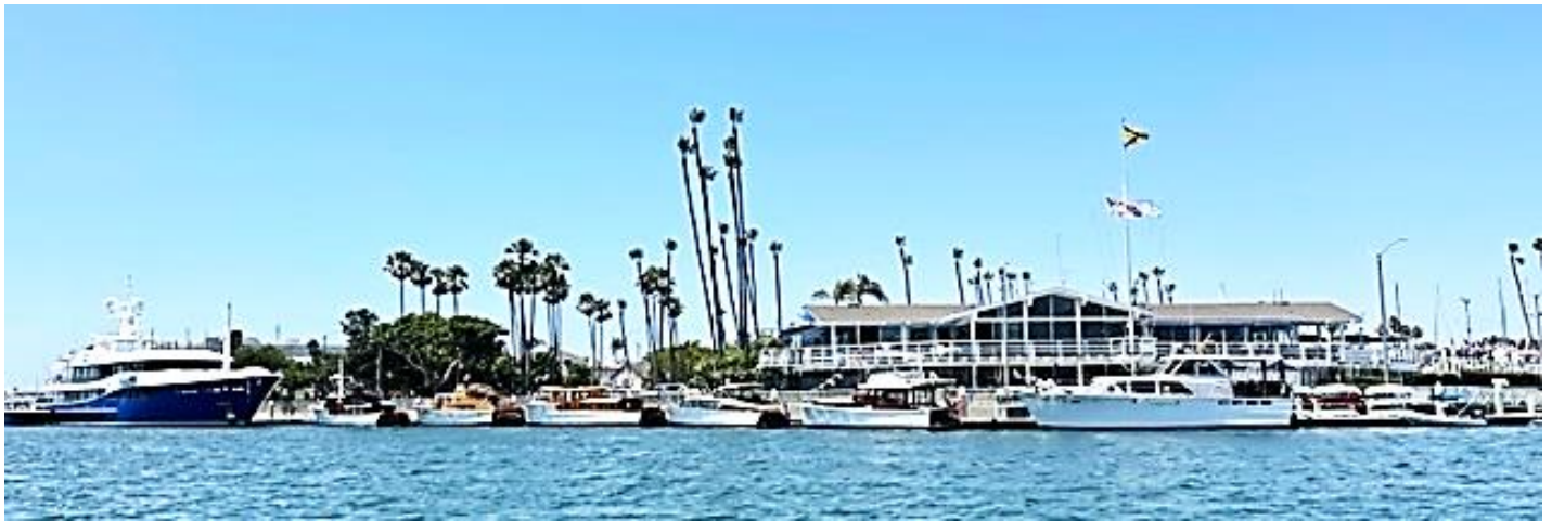
A mega yacht who they implied was someone "known" but we never saw towered over ONO, SEA BOARDER, ATHENA, COMOCEAN, VERA LEE, DIONYSUS, OLD WOOD