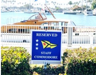
Coincidental "RESERVED PARKING STAFF COMMODORE"