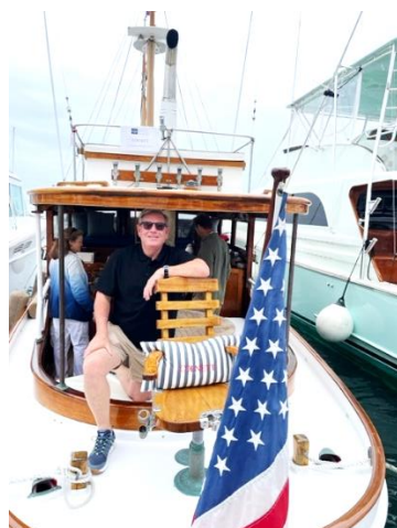
COLNETT: Bunker Hill