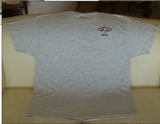
Men's T-Shirt, $16.00