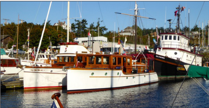
◀ The fleet is well represented at the Port Townsend Wooden Boat Festival.