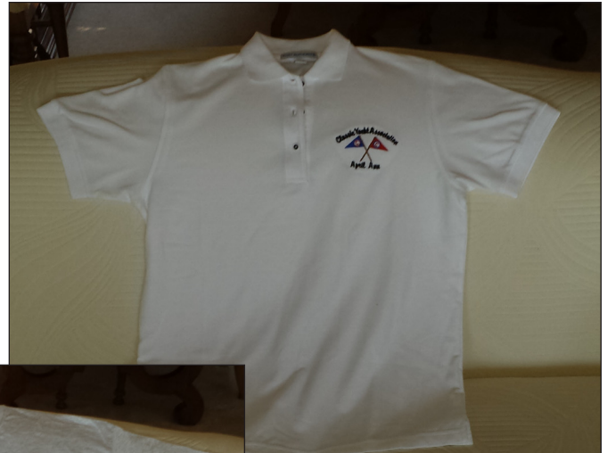
Ladies Polo, $23.00