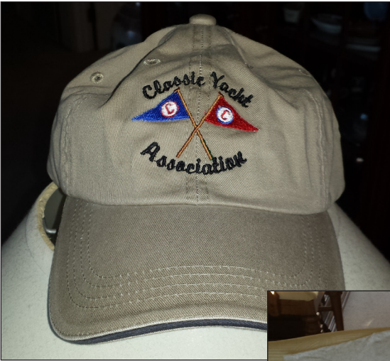
Hat with Logo, $17.00