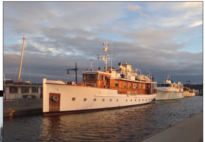
▲ The sun comes out at the Bremerton Marina Classic Yacht Rendezvous.

The CYA members who arrived on Thursday to the Bremerton Marina Classic Yacht Rendezvous were greeted with a good ol' Pacific Northwest rain shower.