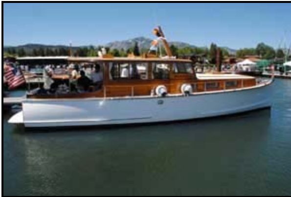
Huapala at Lake Tahoe